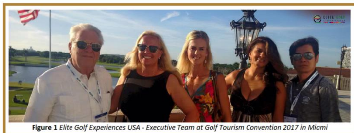
Figure 1 Elite Golf Experiences USA - Executive Team at Golf Tourism Convention 2017 in Miami

...for 7 consecutive years by World Golf Awards